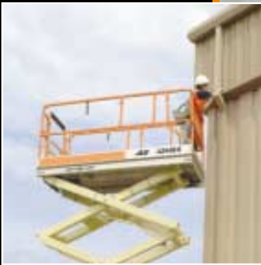
CE Rated for Indoor/Outdoor Usage