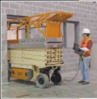
Compact Size and Narrow Widths For Ease of Access