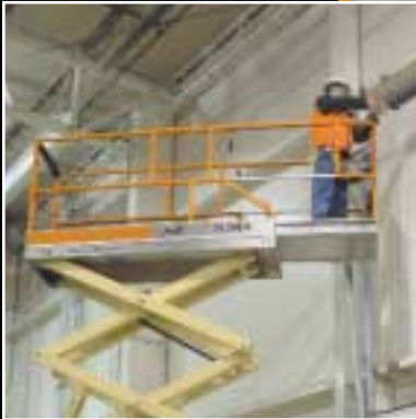
Larger Platforms and Higher Capacities